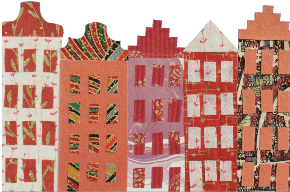
Art by Anja Polstra