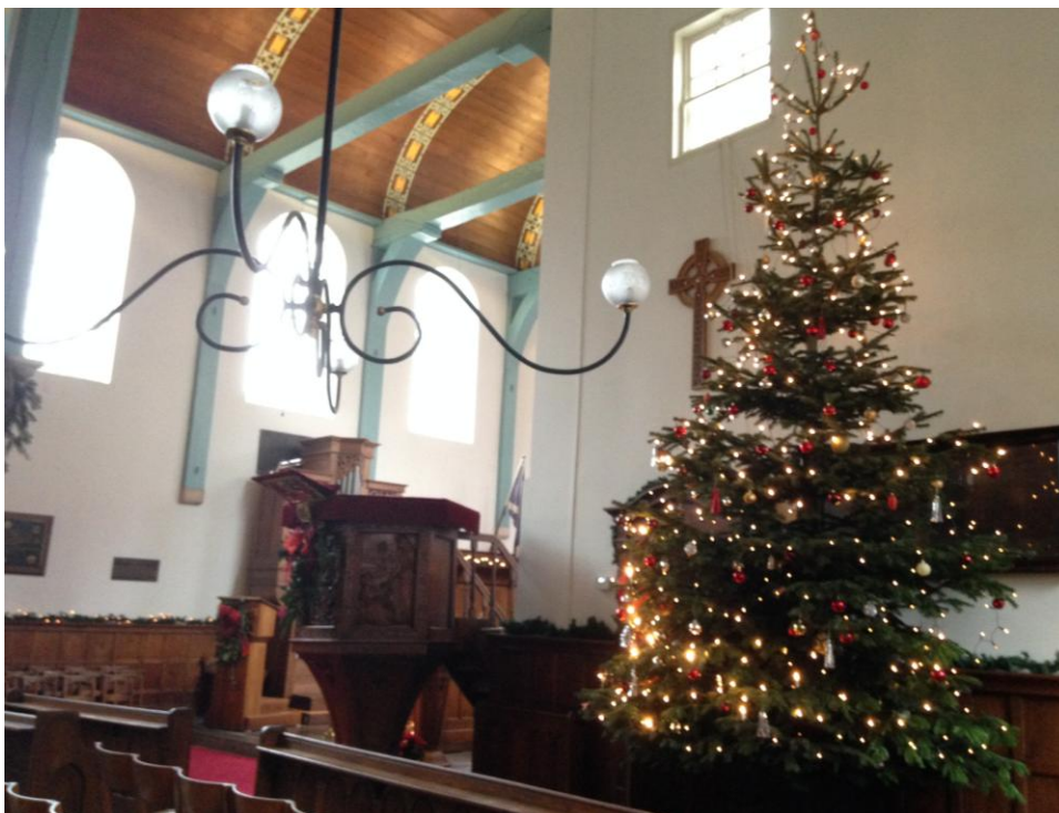
Christmas at the ERC