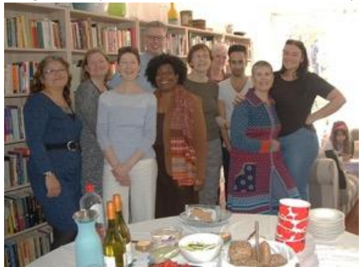
The Outreach and Social Events Committee