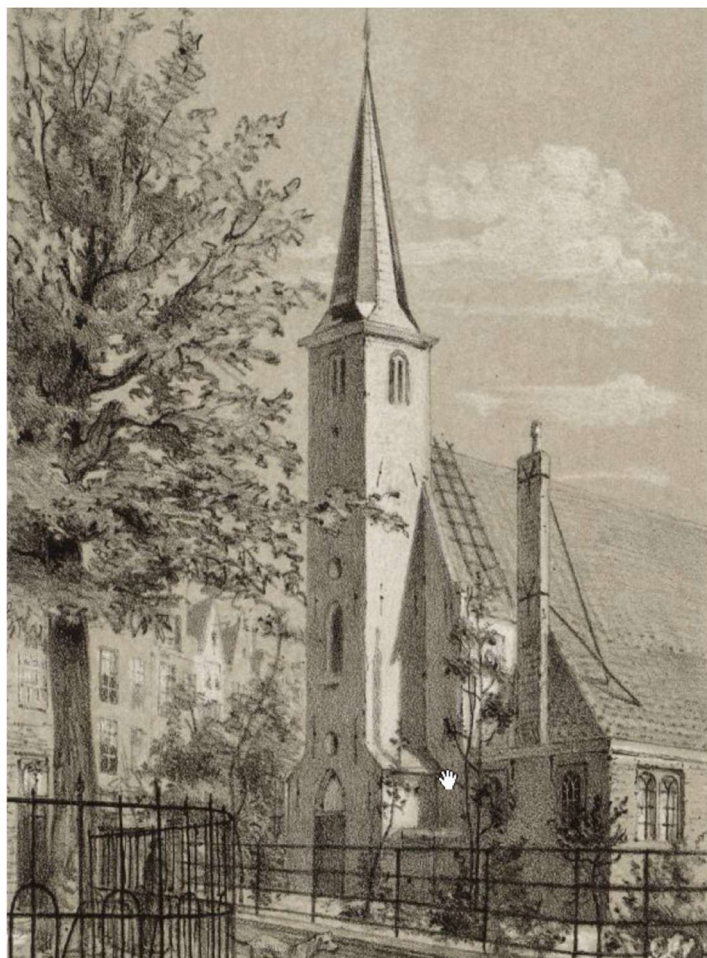
Engelse Kerk, litho 1880 by J.C. Braakensiek

During 2017 the total receipt of donations increased, through donations received from individual persons and especially those from visitors of the church, who leave their donations at the treasury chest at the porch of the church. This has been greatly encouraged by the many volunteers , who help to keep the church open to visitors during the week. We are grateful to all those who have supported the Friends Foundation in the past and those who offer their support in the future.