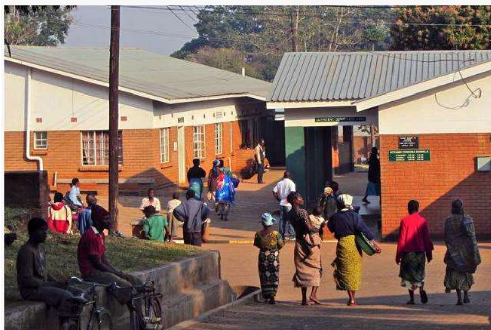
Mulanje Mission Hospital