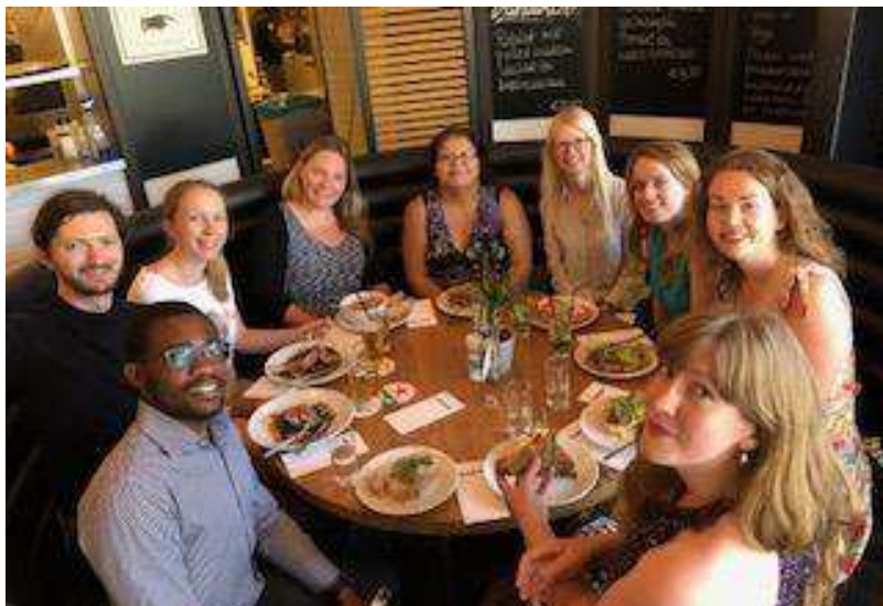
The July lunch