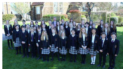
The Churcher's College Junior Choir that visited last July