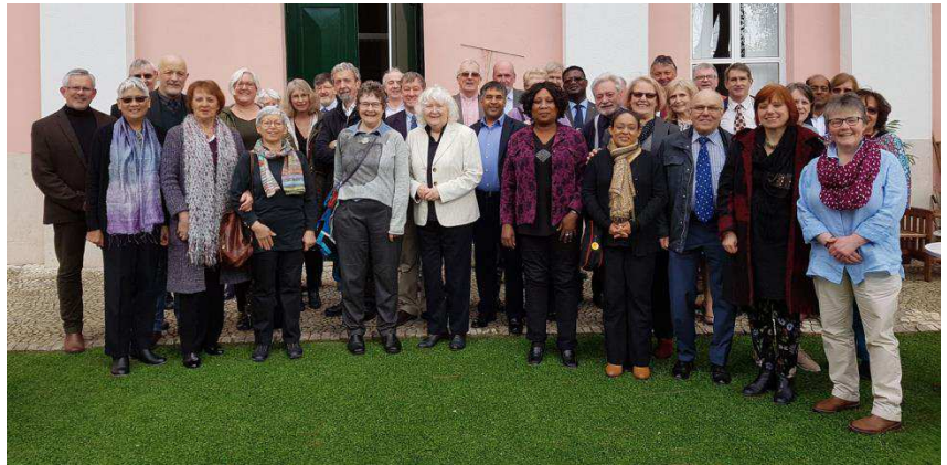
Members of Presbytery at St Andrew's Church, Lisbon, March 2018

In October (12th -14th) around 35-40 Presbyters from congregations in Rotterdam, Lausanne, Brussels, Geneva, Budapest, Gibraltar, Paris, Colombo, Bochum, Malta, Lisbon, Bermuda, Jerusalem and Fuengirola will come together in Amsterdam. Our church is hosting this occasion.