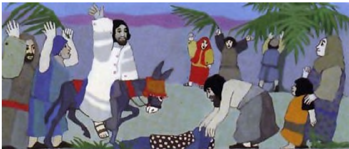
From the Dutch Kijkbijbel by Kees de Kort