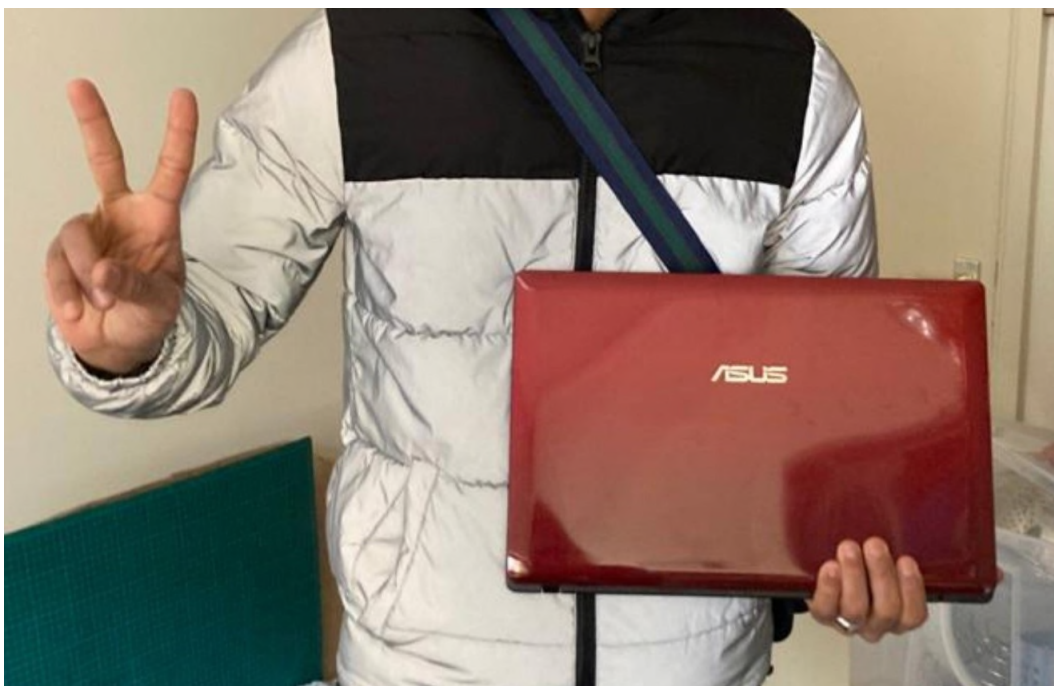
A happy owner