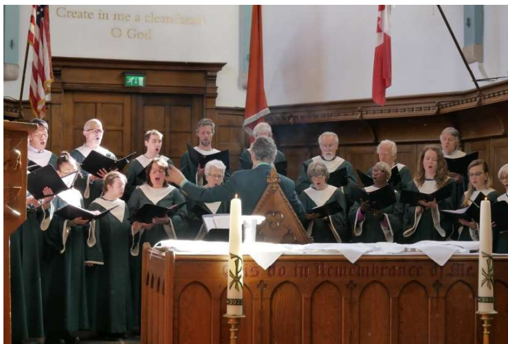
The choir on Easter Sunday